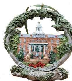
St. Michael's School