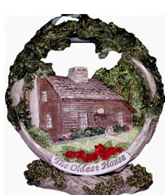
Laceyville-The Oldest House