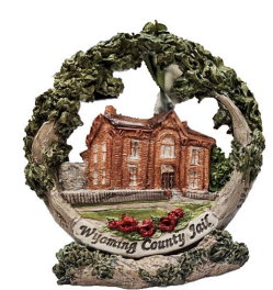
Wyoming County Jail

Available at the Wyoming County Historical Society