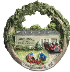
Triton Hose Company