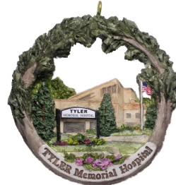
Tyler Memorial Hospital