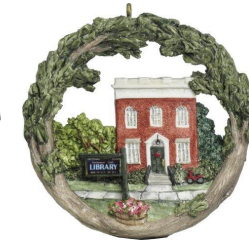
Tunkhannock Public Library