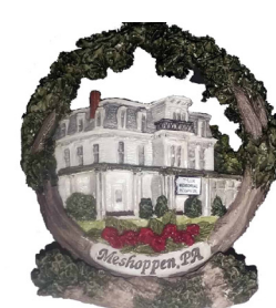
Tyler Hospital Meshoppen