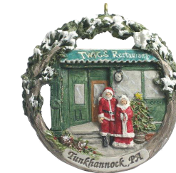
Christmas in Our Hometown/ Twigs Restaurant