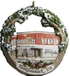
Fitze's Dept Store