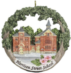
Harrison Street School