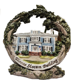
Thomas Slocum Building