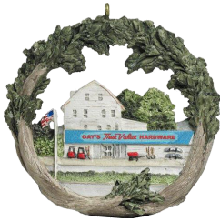
Gay's True Value