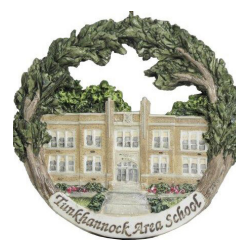
TAS High/Middle School