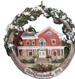
Frank L. Sittser Home