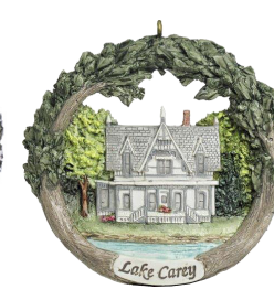
Lake Carey/Wheaton House