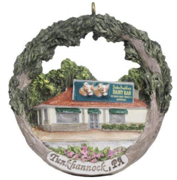
Shadowbrook Dairy Bar