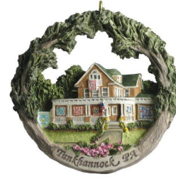
Airing of the Quilts